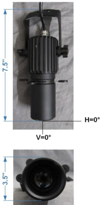
FIG. 1 LUMINAIRE