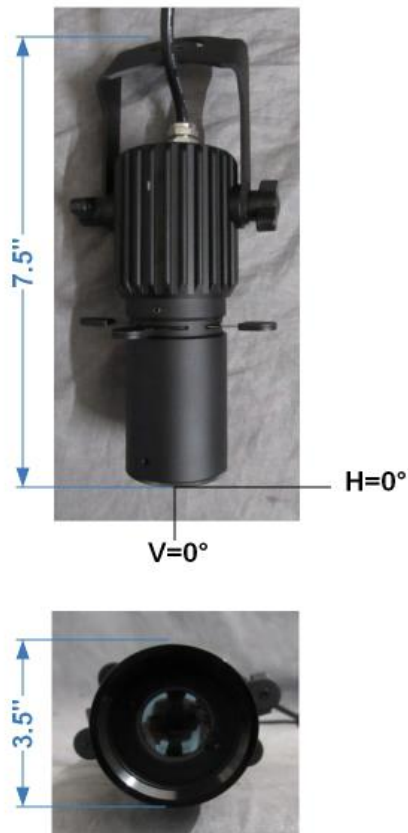
FIG. 1 LUMINAIRE